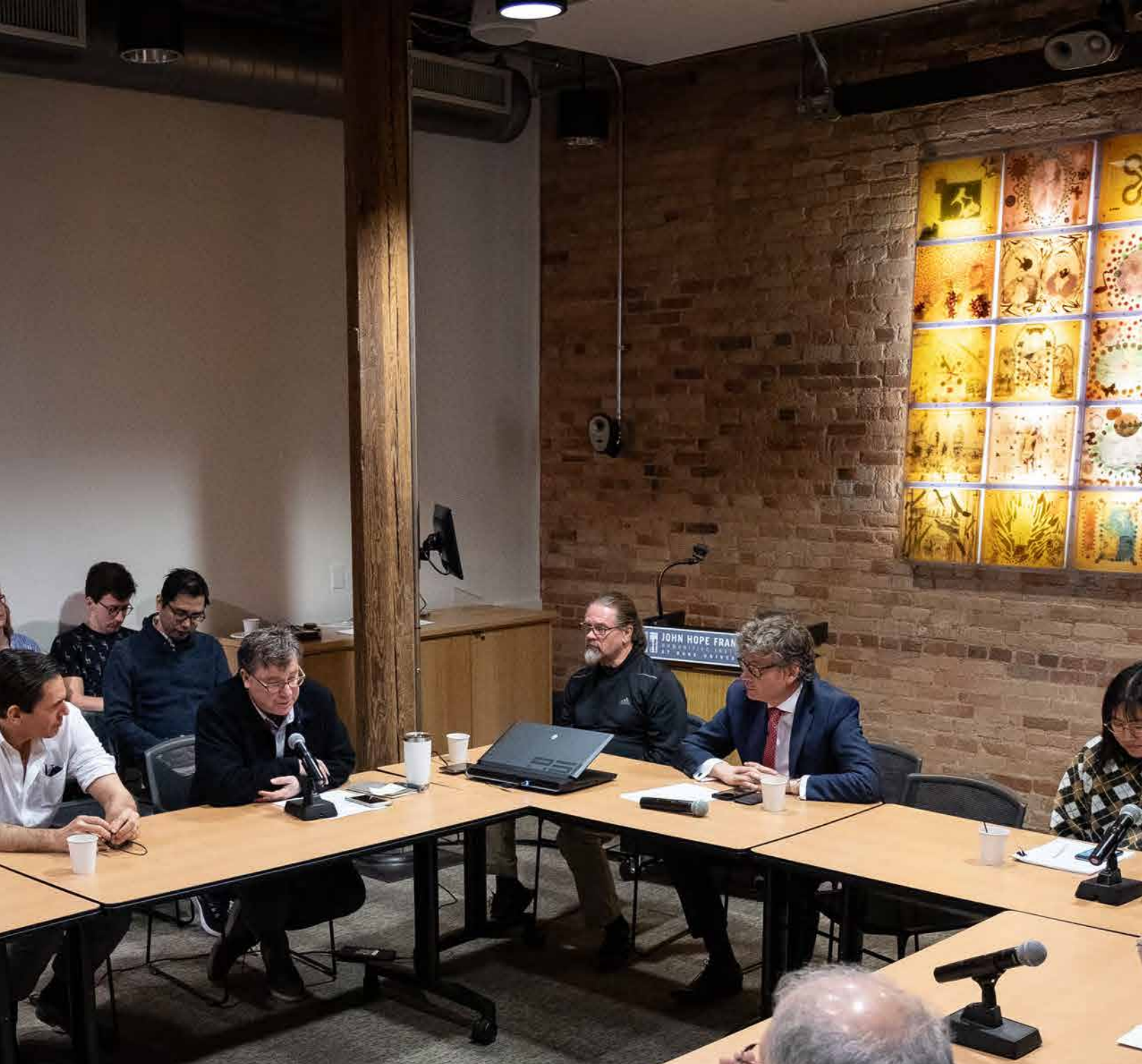
Coronavirus roundtable co-hosted by the FHI and DKU Humanities Research Center.

The FHI's Global Partnerships promote research, teaching, and institutional exchanges across borders, languages, and intellectual traditions.